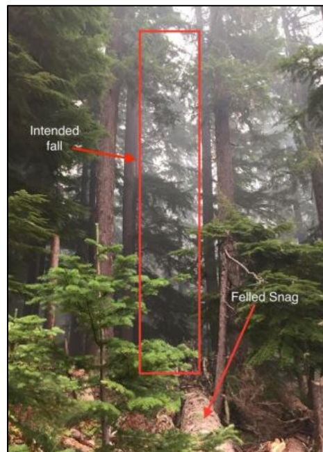
Figure 2 – This tree fell in the direction intended, but the top broke and came back. To read about this incident, see this report Whitewater Tree Strike .

19% of the time, the top broke out and came back—including 2 of the 8 fatalities.