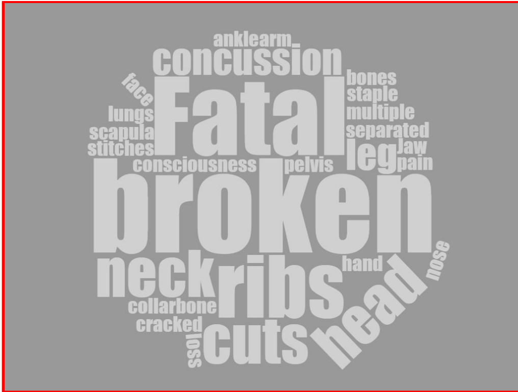
Figure 1 – This "Word Cloud" was generated using the injury descriptors from the 53 incidents included in this analysis. The size of a word indicates its relative frequency.

This Tree Felling Accident Analysis was completed by the Wildland Fire Lessons Learned Center (LLC) at the request of the Chief, NPS Fire and Aviation Management, and Director, USDA Forest Service Fire and Aviation Management. This report is one of nine actions specified in the 2019 Hughes Fatality Joint Corrective Action Plan. The corrective action that generated this report reads: "Propose all wildland fire tree and chainsaw related accident reports since 2004 be reviewed, associated recommendations evaluated for redundancy or conflict, and the current implementation status of recommendations to assist in setting priority actions to reduce similar incidents." The LLC produced this report as requested, explaining "it is important to note that the vast majority of 'recommendations' listed in reports are aimed at individual firefighters or local organizations. There is no practical way to track down any sort of 'implementation status' on these types of recommendations."